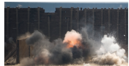
A technician practices a rope rescue exercise (top). Some research, development, test, and evaluation activities include detonating an improvised explosive device to develop better ways of combating them in the field (bottom).