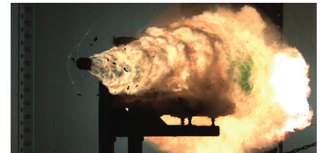
Research, development, test, and evaluation activities include the testing of unmanned aerial vehicles (top), as well as electromagnetic railgun, a long-range weapon that fires projectiles using electricity (bottom).