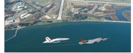
NAS Patuxent River and the Atlantic Test Ranges serve as an important flight testing site.

Acquiring easements under the restricted airspace and around NAS Patuxent River and OLF Webster also limits development of waterfront parcels, and protects the health of the Chesapeake Bay and its tributaries. In addition, these projects also help sustain local agriculture and commercial and recreational fishing economies. Meanwhile, ATR and NAS Patuxent River can continue providing the test and evaluation capabilities that ensure safe and effective high-performance aircraft and aviation systems.