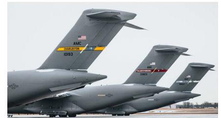
Preserving wetlands outside of JB Andrews (top) enables the installation to carry out mission-critical infrastructure improvement projects (bottom).