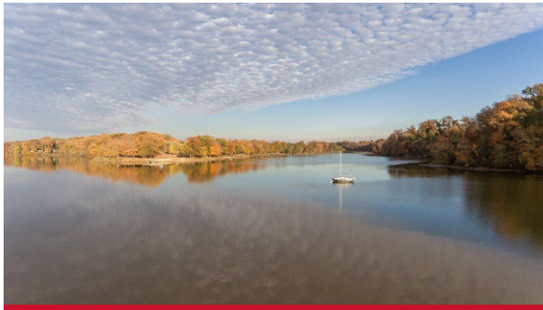
Creek view of the Bracebridge Hall Property.

The Eastern Shore Land Conservancy's work includes conservation efforts in Cecil County, where 441 acres of agricultural land and critical species habitat were preserved through ACUB in 2020. The Bracebridge Parcel easement is located off Back Creek and McGill Creek and is one of several in this area of the county. Supported by funding from the Maryland Department of Natural Resource's Rural Legacy Program and the Army's Compatible Use Buffer Program, the preserved property is the Bracebridge Hall location for the Recovery Centers of America.