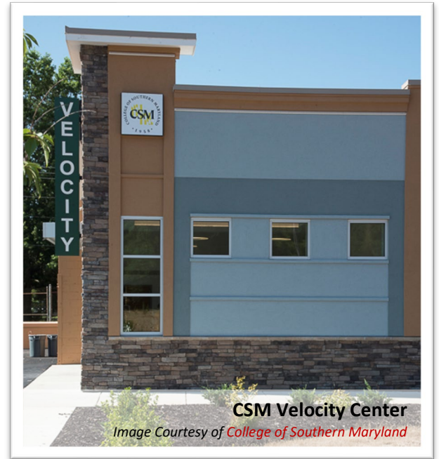
CSM Velocity Center

The Velocity Center houses many types of spaces that can be utilized by the military and community. A variety of conference and meeting spaces, shared flexspace workspaces, and a makerspace are available to host community, Navy or professional development events. Navy scientists can use the space to collaborate with local students in tech transfer classes, while residents are welcome to take workforce and professional development courses hosted by CSM. The 1,984 square foot Makerspace is a community workspace equipped with 3D printers/scanners, laser cutters, soldering irons, and additive and subtractive machines for manufacturing. It also includes hardware and software for cyber/gaming, CAD modeling, simulation, app development, robotics, and prototyping.