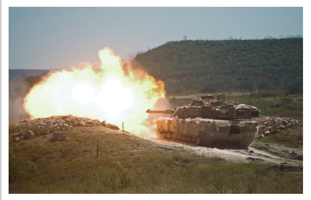
2nd Armored Brigade Combat Team, 1st Cavalry Division M1 Abrams tank during gunnery training at Fort Hood, Texas.

need to conduct high-quality testing and training throughout the year. Negative community reactions to military noise are often a challenge to this essential training. As a result, the Military Services focus a significant amount of time and resources on studying, communicating, and addressing noise generated by military activities to protect essential testing and training.