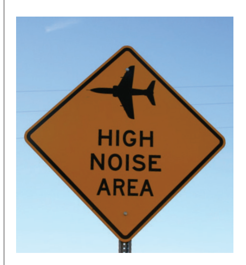
Naval Air Station Meridian partnered with Lauderdale County to post signs near areas exposed to higher levels of aircraft noise from nearby military training activity. Location of the signs were determined based on noise studies conducted at the installation. The signs have helped inform new home buyers, lessees, and realtors of areas that are exposed to higher levels of long-term aircraft noise exposure.

Noise studies are a comprehensive look at a community's exposure to installation and range noise from current or future military activities. These studies produce maps that depict noise exposure levels (usually in DNL) that align with a common set of land use compatibility guidelines adopted by federal, state, and local governments. The studies recommend land uses for surrounding areas based on current and future military activities. Land use compatibility guidelines for noise provide agencies with the maximum recommended exposure for specific land uses and activities. For example, recommended maximum exposure levels for industrial land use are higher than recommended sound levels for residential areas or where schools and childcare facilities may be present.