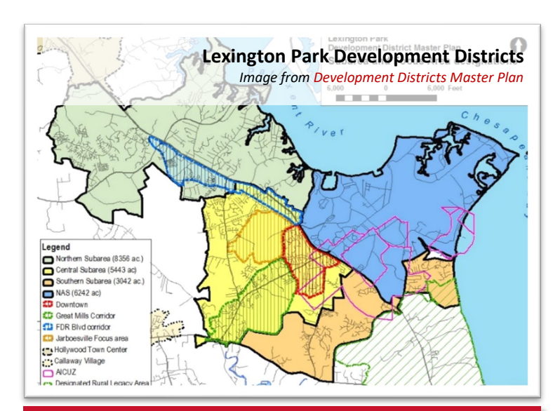
As new and infill development occur in the area, street networks should be designed to strengthen visual and physical connections between NAS Pax River and Lexington Park.

expanding sidewalk and bikeway networks even when improvements to vehicle travel lanes are not planned. Other recommendations include providing marked pedestrian crosswalks at new and existing public roads and expanding connections to sidewalks and hiking and biking trails.