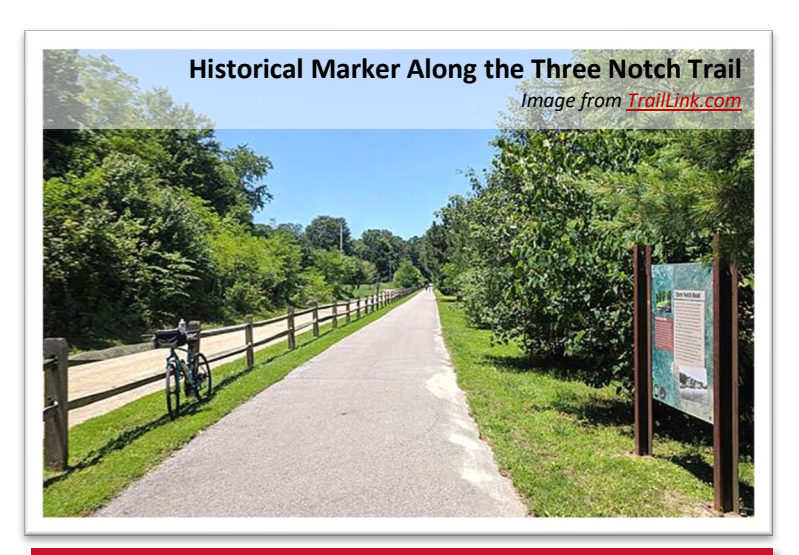
Many St. Mary's County planning studies references the desire to expand the network of sidewalks and bicycle trails to provide alternative modes of transportation.